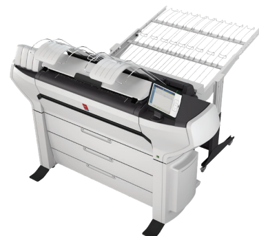
Océ ColorWave 3700 with Océ Stacker Select