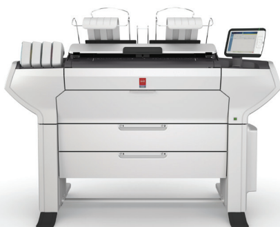
Océ ColorWave 3500

The Océ ColorWave 3000 series comes in two models: The Océ ColorWave 3500 for worry free walk up printing, while the Océ ColorWave 3700 targets customers requiring higher media capacity and media versatility.