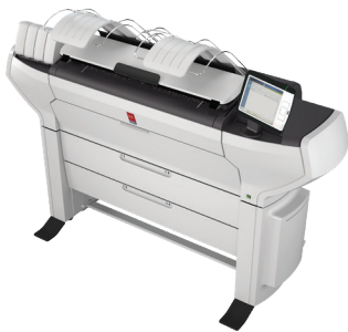
Océ ColorWave 3500 standalone

The Océ ColorWave 3000 can print on a wide range of media, enabling a wide range of applications - from high-quality technical documents to full color graphics. With a media capacity of up to 6 rolls, the Océ ColorWave 3700 model enables you to productively mix applications or to run large jobs without interruption. Additionally the Océ ColorWave 3700 model exclusively offers Océ MediaSense technology that automatically adjusts the gap between the imaging device and media, for high-quality output without manual adjustments. Océ MediaSense technology provides the ability to grow application volumes for a faster return on investment. The versatile Océ CrystalPoint printing technology offers instant-dry prints with no feathering and excellent fine detail on a variety of media types, from thin, uncoated paper to vinyl. The Onyx workflow support helps you to easily fit the Océ ColorWave 3000 series into your graphic arts workflow.