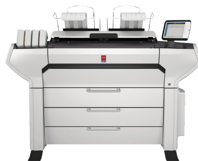
Océ ColorWave 3700