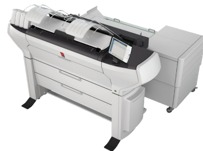
Océ ColorWave 3500 with Océ Folder Express 3011