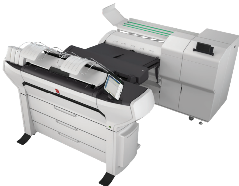
Océ ColorWave 3700 with Océ Folder Professional 6013