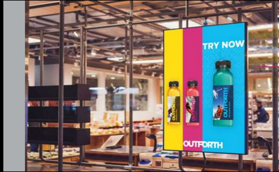
FRAMED SOFT SIGNAGE RETAIL POSTER Environmentally friendly products in style, confirmed by GREENGUARD Gold.