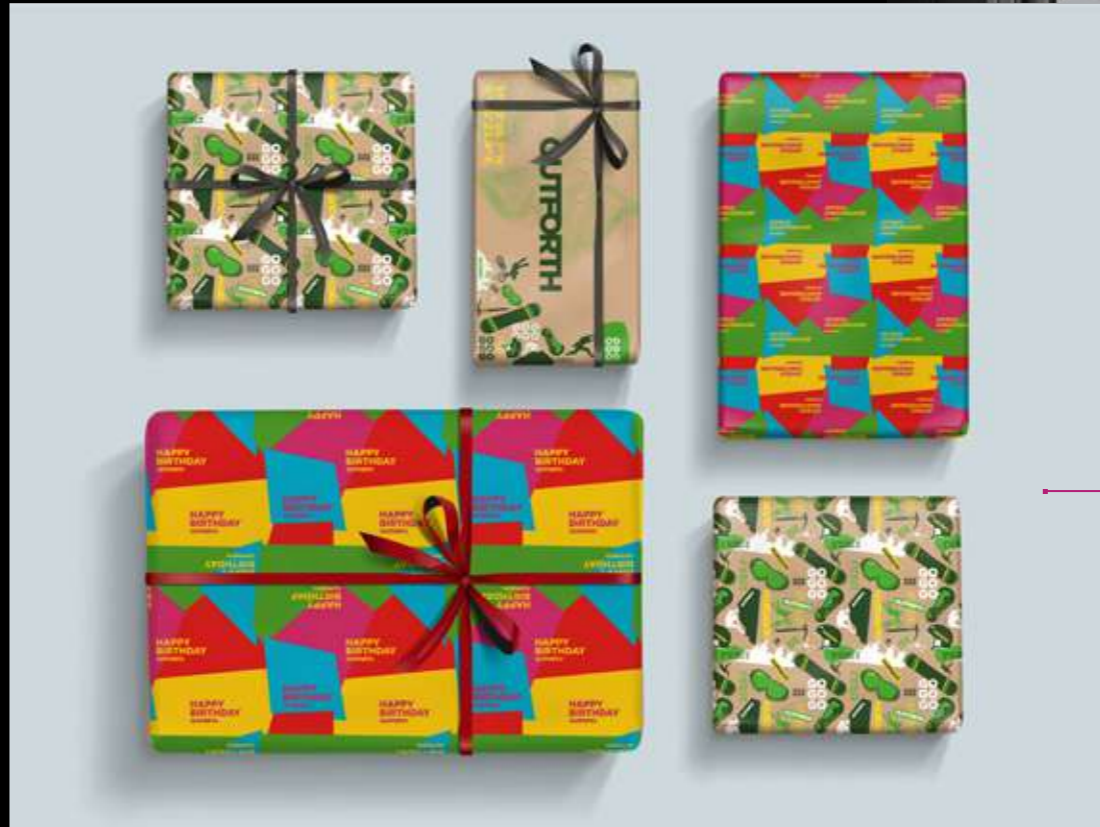
WRAPPING PAPER Create personalised gifts for that perfect moment they will never forget. Of course, printed sustainably with UVgel on uncoated and recyclable media.